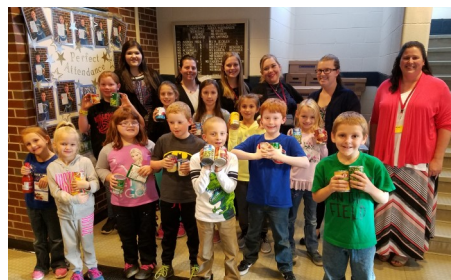
Fall Food Drive 2017